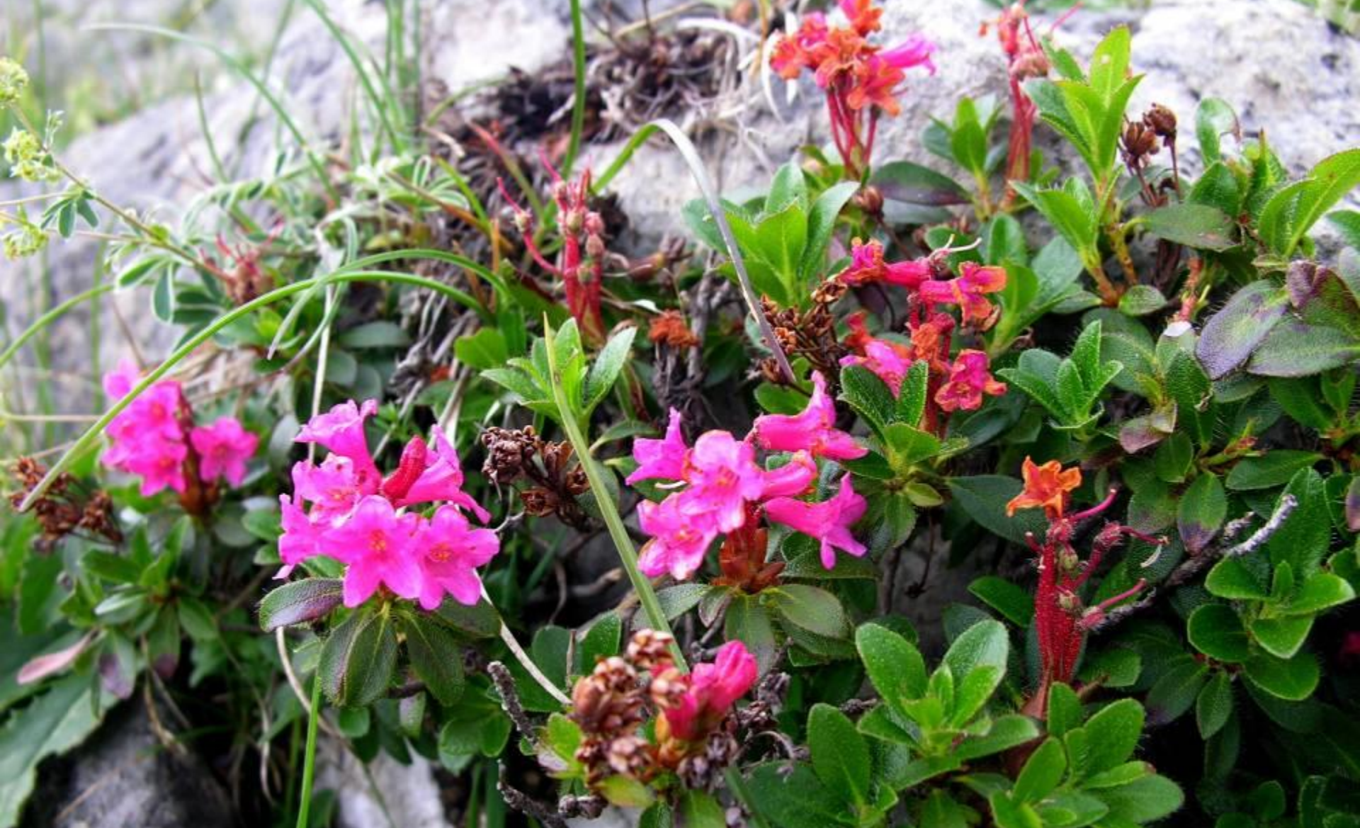
Pěnišník - Rhododendron sp.