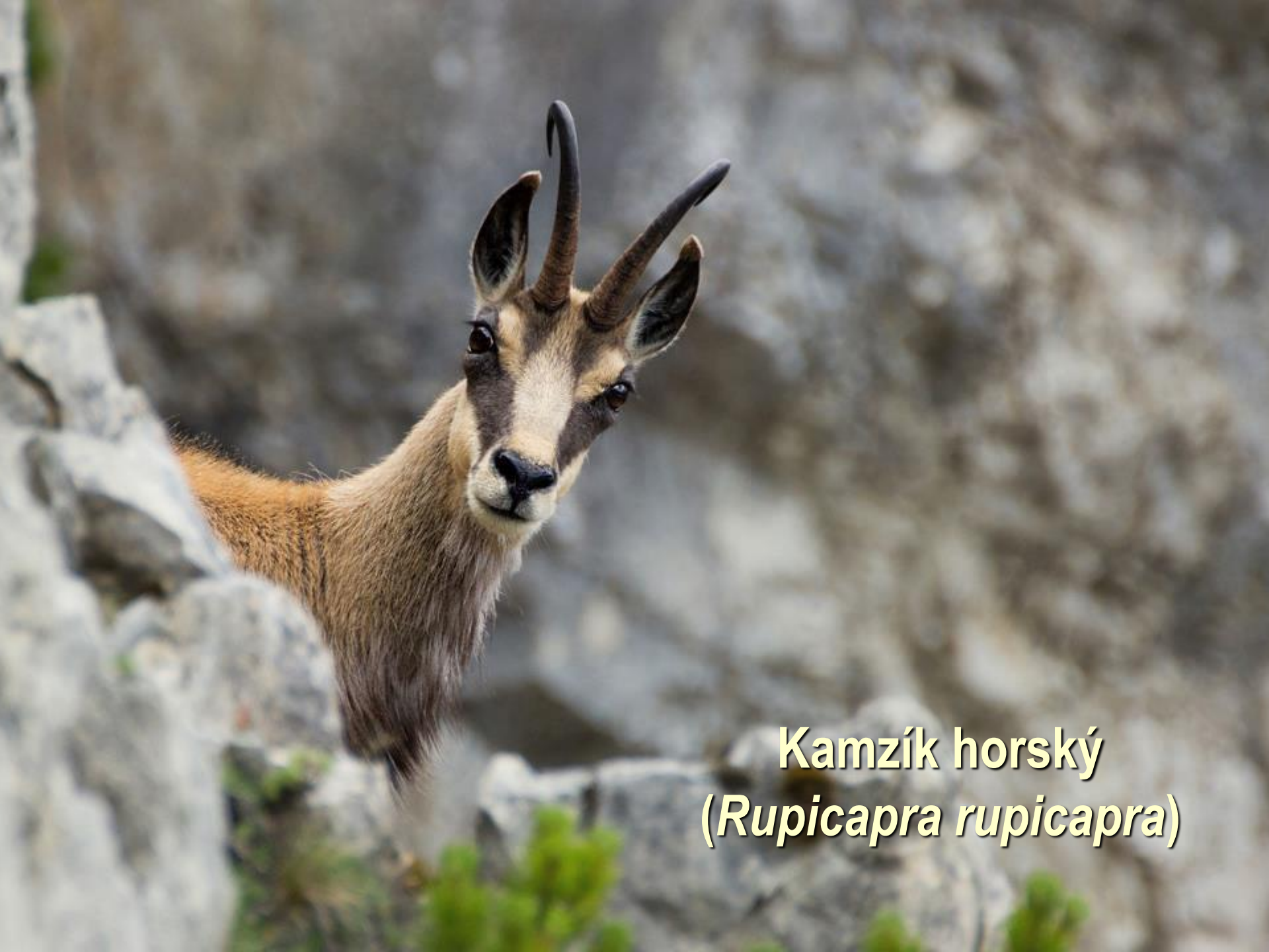
Kamzík horský ( Rupicapra rupicapra )