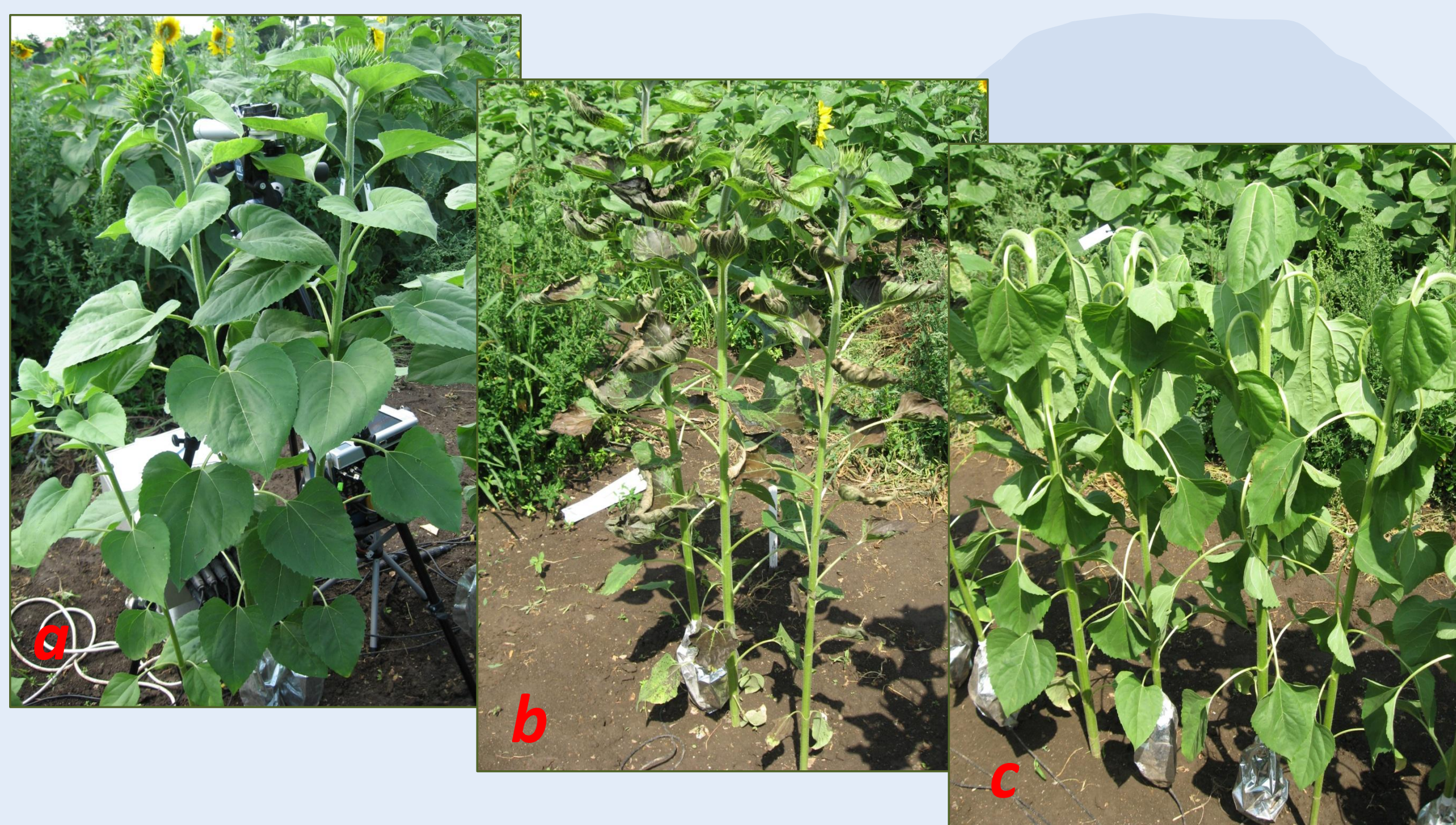
Plants of H. annuus 2 days after the herbicide treatment in the year 2009 (a – control plants, b -bromoxynil and c - clopyralid).