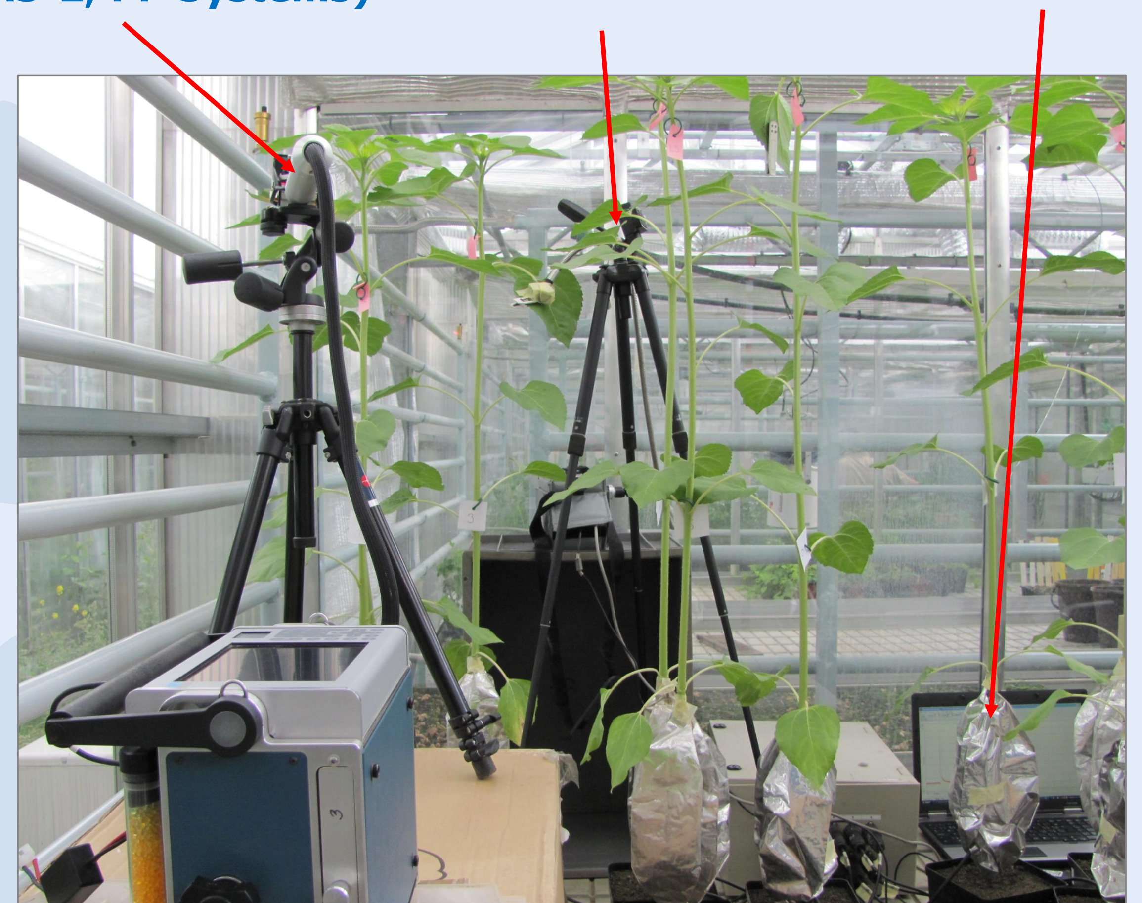
Determining the effect of herbicides on the plants in the year 2010